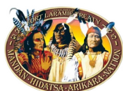
MHA Nation Tribe